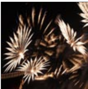
Fireworks light up the sky every night as part of Epcot's Illuminations show.