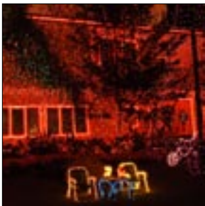
One of the houses from the Osborne Family Spectacle of Lights display at MGM Studios.