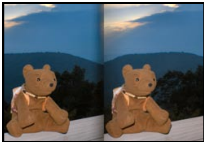
Bear Bear enjoys the sunset at Rainbow Mountain

Method two, requires identical cameras, and though any camera can be used, some are better suited than others. The key to taking a 3d photo that can easily be seen, is the spacing between the two lenses. Since we are trying to simulate what is seen by two average human eyes, the spacing for most pictures is about that of the spacing between two eyes, or an average of 65mm. Due to the placement of the lenses, some cameras cannot be used. The synchronization of hitting the shutter releases at the same time is also tricky. Any amount of difference, can lead to the same problems discussed in the next paragraph.