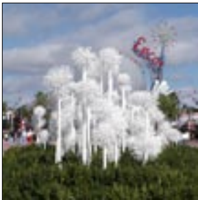
Holiday decorations abound throughout the Parks. These white trees are at Epcot.