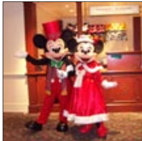
Mickey and Minnie Mouse in the Exhibition Hall at Magic Kingdom are decked out in their Holiday outfits.