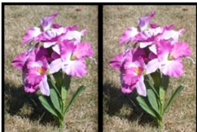
Flowers in the Ellijay Cemetery

The first method, using a stereo camera, is the method that Steve has been employing for years. This is the easiest way to shoot 3d photos, the problem is that most of the stereo cameras are 50 years old. Like anything that age, these cameras often need repairs. The few ones that can be bought new today are very expensive.